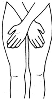
Fig 3. Just quietly hold your thighs left and right,